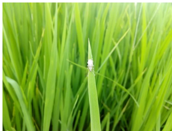
Ashweevil on rice leaf in Kollengode