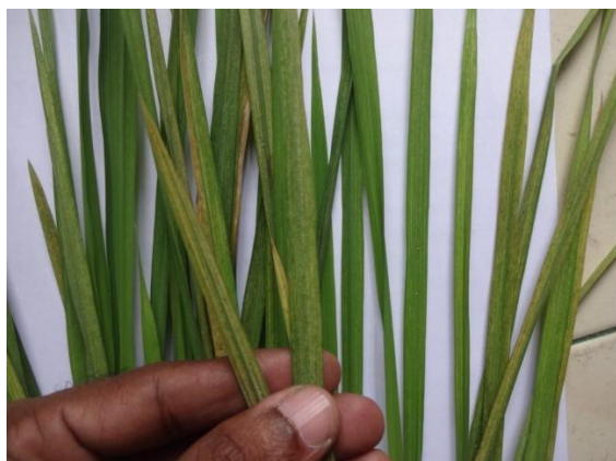
Leaf infested with mites in Nemmara

Other observations: Severe incidence of BLB (97%)