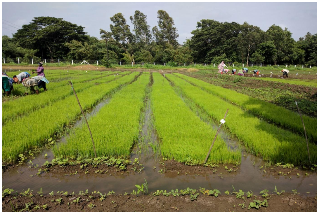
Nursery, variety GR-11at MRRC, NAU, Navsari